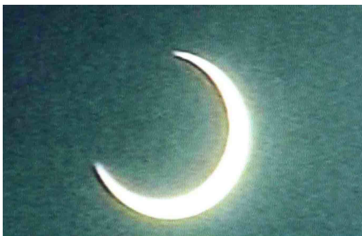
Mid-day Solar-Eclipse, January 15, 2010